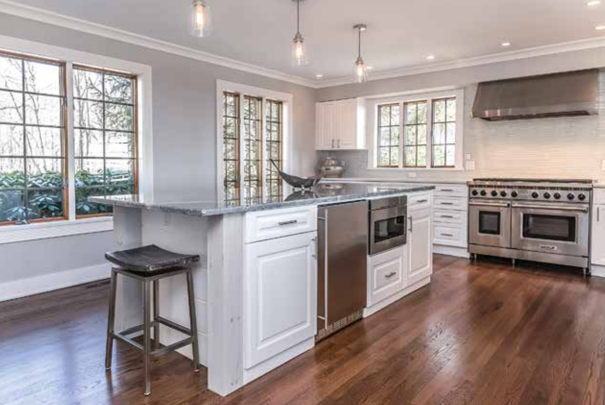
COOK OF DREAMS The newly renovated kitchen sports top-of-the-line appliances and elegant design, while the master suite sports top-shelf views.